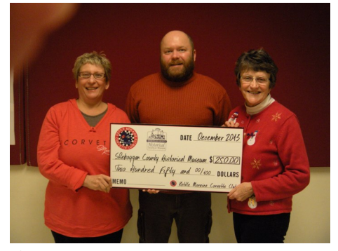
$250 presented to the Museum by the Kettle Moraine Corvette Club

If you might have materials we are looking for, or if you know someone who does, we would love to talk with you. It is best if you contact the Museum prior to dropping by to ensure a staff member will be available to talk with you regarding the items.