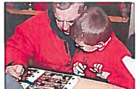
UW-Extension Sheboygan County programs help support 8,662 jobs and $3.1 billion in agricultural related economic activity in the county.