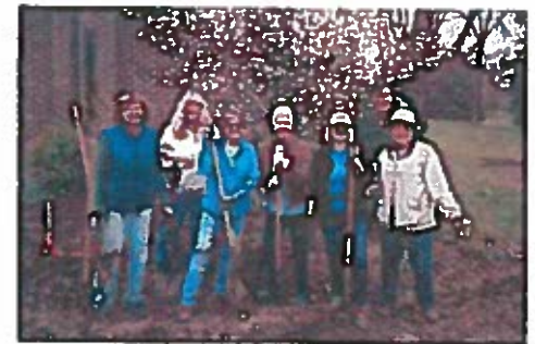
Master Gardener Volunteers help with landscaping at UW-Extension & UW-Sheboygan

UW-Extension Master Gardener Volunteers (MGVs) are trained individuals who support UW-Extension Educators by helping people in the community better understand horticulture and their environment. During 2016, 90 MGVs provided nearly 4,500 hours of horticultural expertise to Sheboygan County residents. Since 2000, Sheboygan County Master Gardener volunteers have provided 64,251 volunteer hours at a value of over $1,204,572. The goal of the MGV program is to train enthusiastic volunteers who provide information and guidance on a wide variety of horticultural topics to the general public. An extensive offering of educational programs developed by MGVs in 2016 reached over 300 county residents. You will find Sheboygan County MGVs helping out at the: Old Plank Road Trail, Generations, Marsh Park Tower, Kohler Andre State Park, Meals on Wheels Gardens, UW-Sheboygan Campus, Plymouth Art Center, John Michael Kohler Arts Center, and Sharon Richardson Community Hospice to name a few.