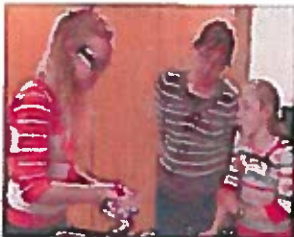
4-H provides opportunities for youth to learn from caring adults.

Over 650 volunteers and consumers were reached with training and resources regarding literacy skills, food preservation, food safety, and parenting skills. 225 children and their parents in Head Start classrooms were impacted by these volunteers on a monthly basis. Over 1,650 volunteer service hours at an estimated value of $28,050 were contributed to families and communities in 2016. An evidence-based multi-session parenting/youth program was provided that has been proven to reduce future costs in drug treatment, lost future earnings, and time in the juvenile justice system.