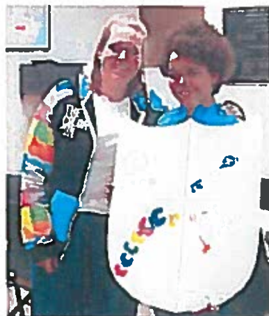
Strengthening Families 10-14 Program Alliance in Sheboygan County builds key family skills.