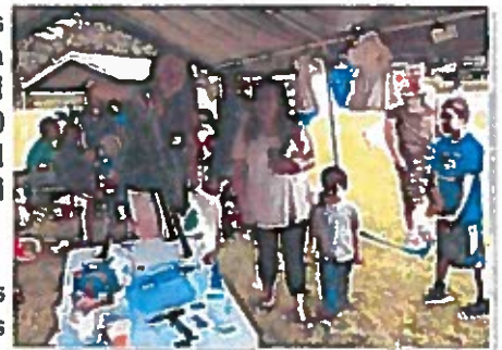
Reaching out to diverse communities through the educational programs of UW-Extension.

UW-Extension adds value to the community through a variety of programs and collaborations that improve relationships, build community, use resources wisely, and foster young leaders. In 2016, nearly 9,500 local residents were directly impacted by UW-Extension programs throughout Sheboygan County, and approximately 250,000