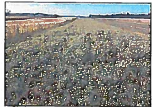
Sheboygan County Cover Crop Research Plot - Plymouth