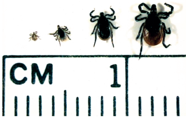
Figure 1. From left to right, an Ixodes scapularis larva, nymph, adult male tick, and adult female tick. The picture is a generous gift from Dr. Richard Falco (Fordham University).

1 month after removing an attached tick should promptly seek medical attention to assess the possibility of having acquired a tickborne infection. HGA and babesiosis should be included in the differential diagnosis of patients who develop fever after an Ixodes tick bite in an area where these infections are endemic (A-II). A history of having received the previously licensed recombinant outer surface protein A (OspA) Lyme disease vaccine preparation should not alter the recommendations above; the same can be said for having had a prior episode of early Lyme disease.