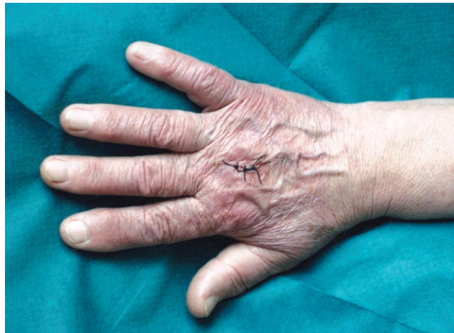
Figure 4. Illustrative example of a patient with acrodermatitis chronica atrophicans.

1. Available data indicate that acrodermatitis chronica atrophicans may be treated with a 21-day course of the same antibiotics (doxycycline [B-II], amoxicillin [B-II], or cefuroxime axetil [B-III]) used to treat patients with erythema migrans (tables 2 and 3). A controlled study is warranted to compare oral with parenteral antibiotic therapy for the treatment of acrodermatitis chronica atrophicans.