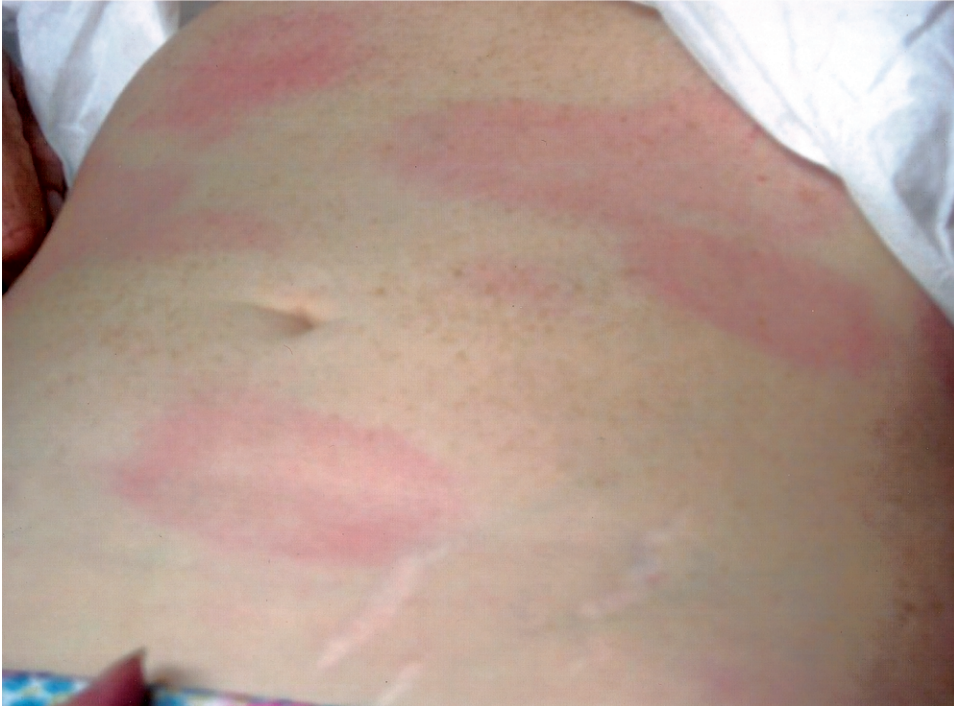
Figure 3. Illustrative examples of culture-confirmed erythema migrans. A , A single erythema migrans lesion of 8.5 \times 5.0 cm on the abdomen. The lesion is homogeneous in color, except for a prominent central punctum (presumed site of preceding tick bite). B , Patient with >40 erythema migrans lesions found. Note the prominent central clearing of the lesions present on the abdomen.